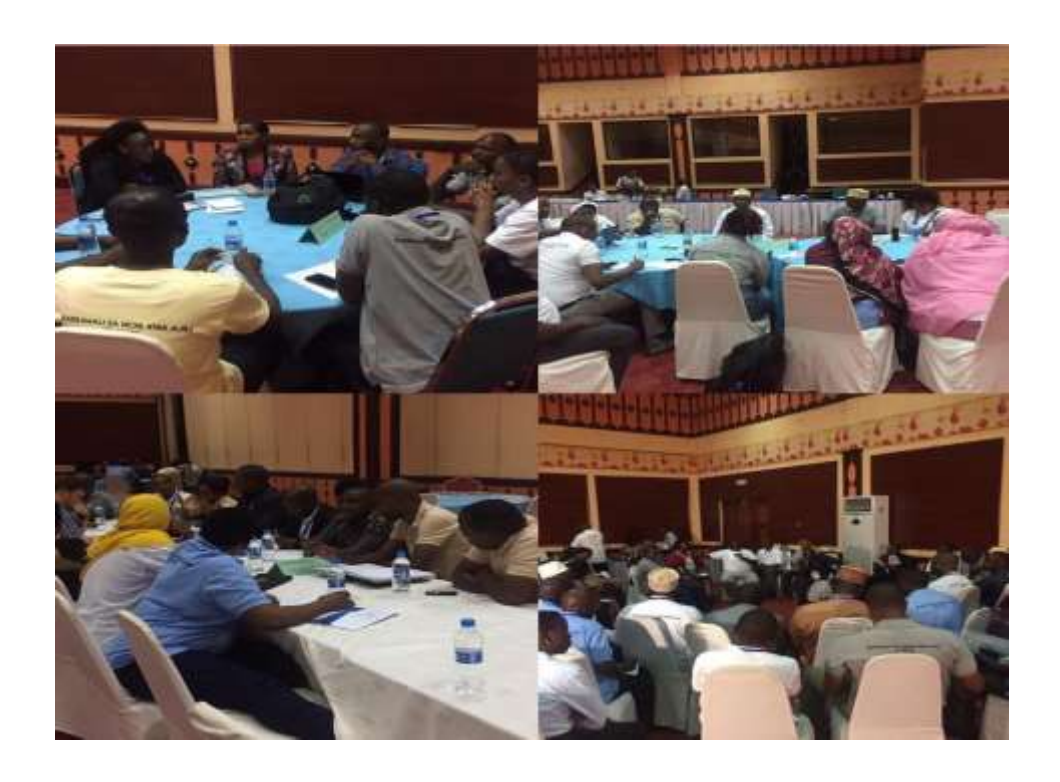
Fig 4. Four thematic workshops during the conference