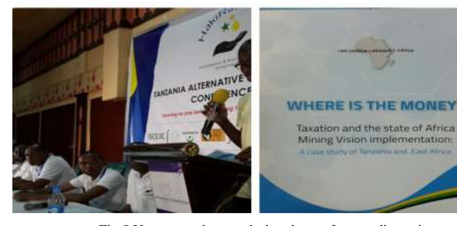
Fig.5 Unanswered query during the conference discussion