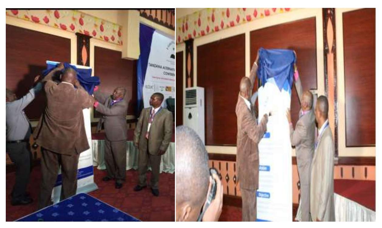
Fig.2 Unveiling o of HakiRasilimali platform by Tanzania deputy Commissioner for minerals

After his speech the Guest of Honor officially opened the conference and launced the HakiRasilimali Platform.