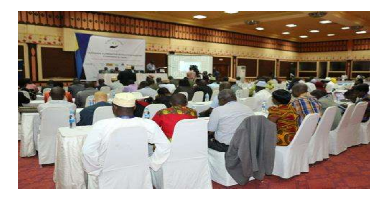
Fig. 3 a segment of participants during the Tanzania

Regarding 0.3% paid to the Local Governments from the mining companies there is no any systematic way to calculate the payment as the exact income generated from the industry is only known to the company.