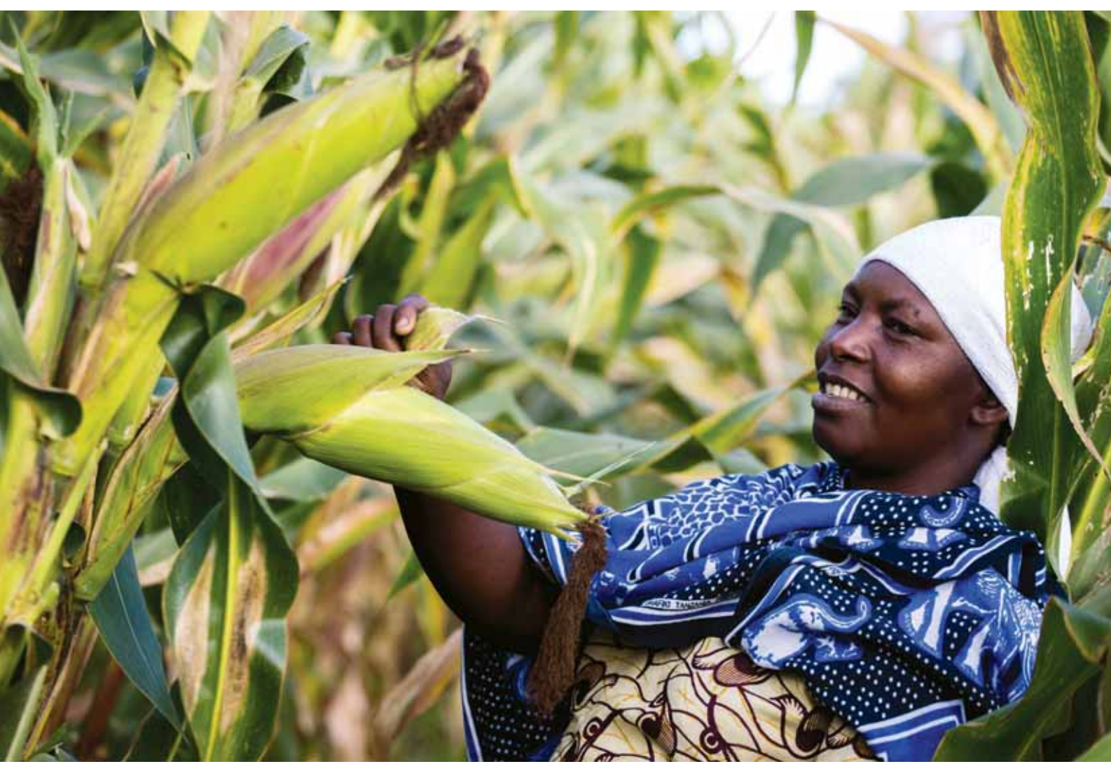
Maize Farming, Kiteto, Tanzania

Among the areas of discussion in the context of local content is 'local-local' content, whereby the issue is not only having goods, services and labour coming from Tanzania but also from the local community near the investment location, such as a village, ward, district or region. The challenge here is one of capacity of local enterprises and labour to supply the needed quantity and quality. This is a further issue on which the government could make progress.