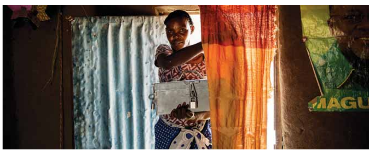
Village Community Bank member in Kishapu, Tanzania

Some groups vulnerable to malnutrition, such as infants, young children, pregnant women and lactating mothers, have not been covered sufficiently in current social protection programmes.<sup>226</sup> There is also a particular need to support people with disabilities and very old people in improved social protection measures. As the UN has recommended, there is also an urgent need to increase and train sector personnel, develop monitoring, referral and response systems, strengthen district and national data collection and promote shared awareness at community and statutory levels of children and women's rights protection.<sup>227</sup> The lack of impact evaluations and documentation means there are significant gaps in learning from past experience within and between programmes.<sup>228</sup>