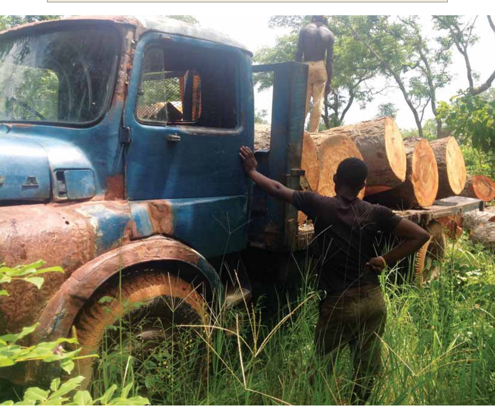
Kikole Village forest reserve in Kilwa, Tanzania

Based on these figures, it seems reasonable to estimate revenue losses of over $1 billion from tax evasion.