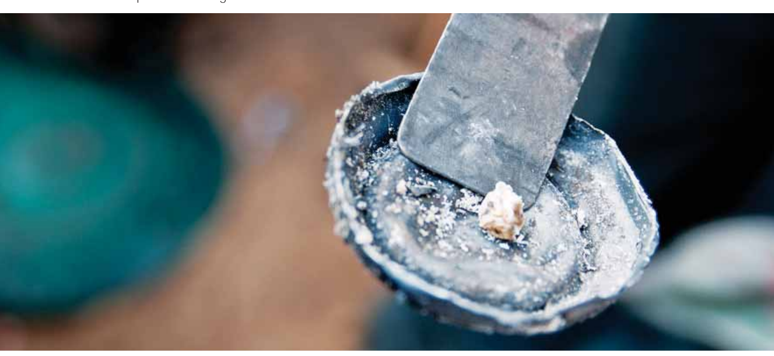
Gold Mining, Geita, Tanzania