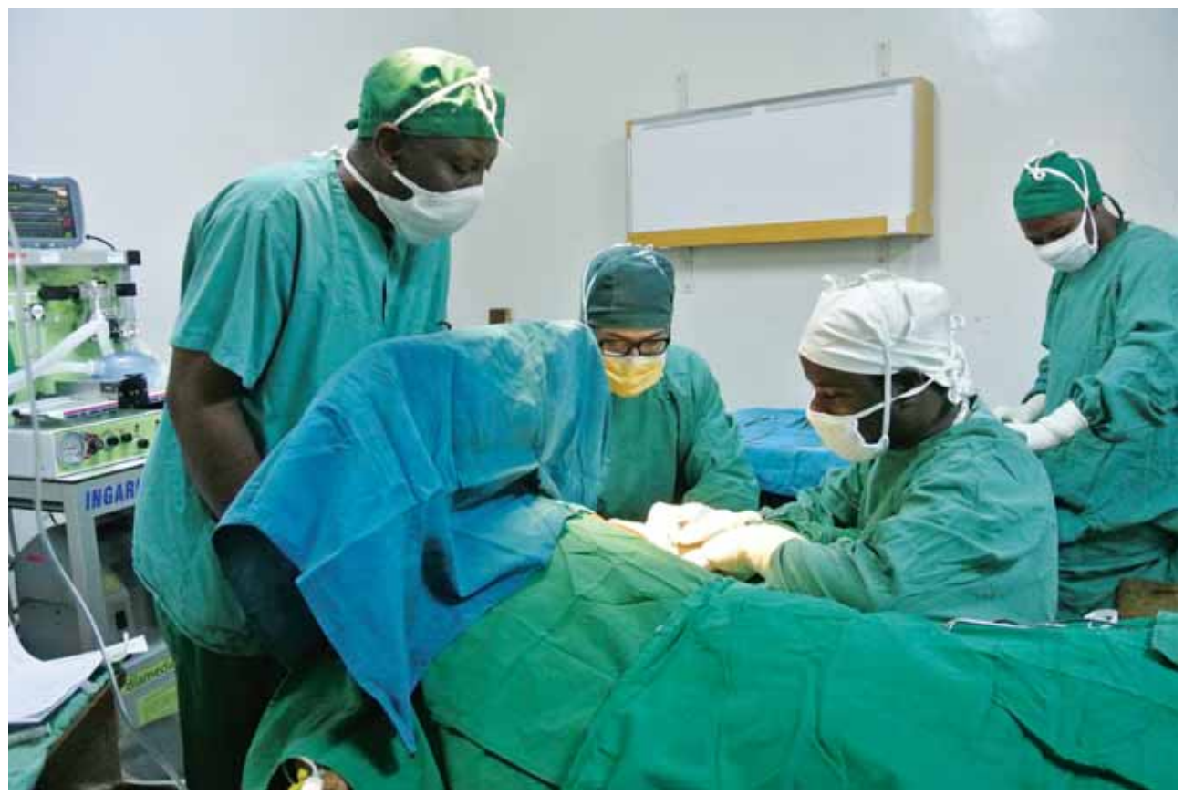
Haydom Lutheran Hospital, Manyara, Tanzania

Source: 'Exemptions granted to large taxpayers January, 2010 to September, 2014', http://www.mof.go.tz/mofdocs/exemptions/ Exemptions%20granted%20to%20large%20taxpayers%20%20January,%202010%20%20to%20September,%202014 Exchange rates: mid-2013: TShs 1,631/$; mid-2014: TShs 1,657/$