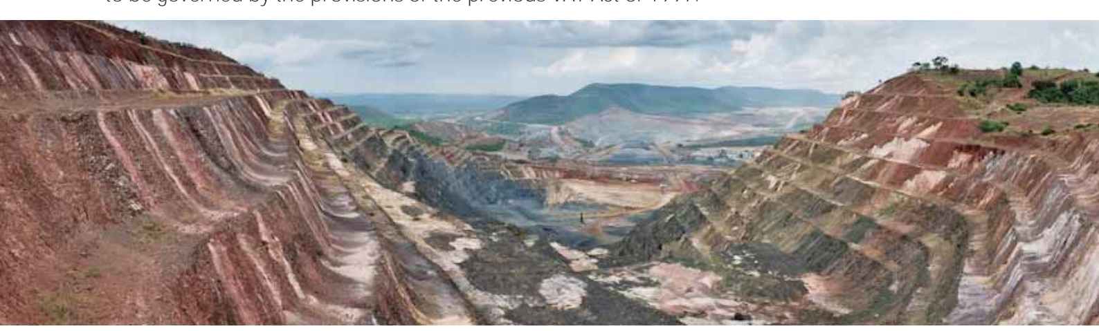
Open pit Mining, Geita, Tanzania

The VAT Act which became operational in July 2015 gives mining companies VAT exemptions on imports of goods for use in the oil, gas or mineral exploration or prospecting activities. But agreements made before the VAT Act relating to exploration and prospecting of minerals continue to be governed by the provisions of the previous VAT Act of 1997.<sup>178</sup>