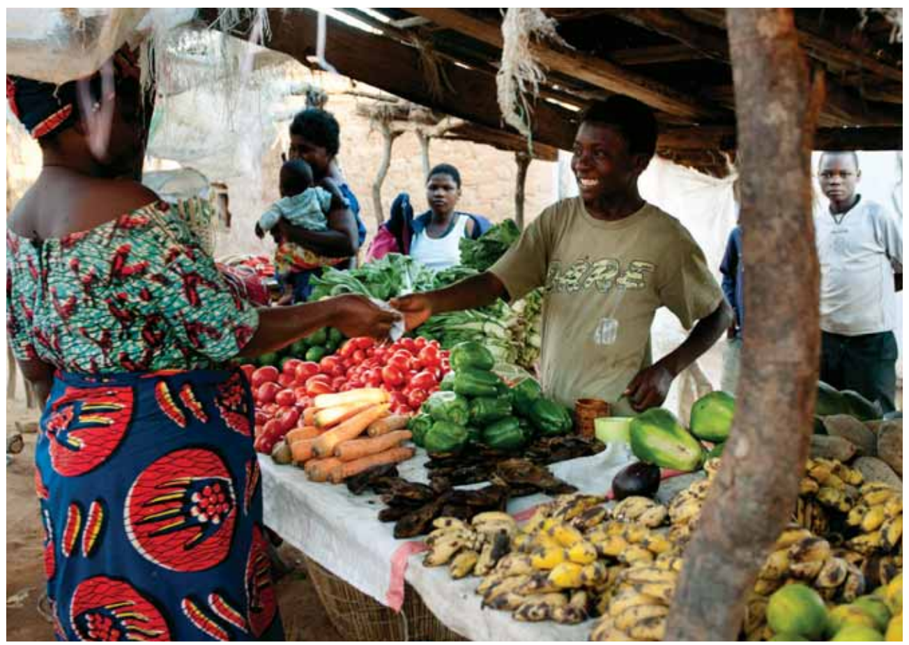
Chunya, Tanzania

Despite this improvement, the IMF notes that more reform needs to be done to bring VAT revenue yield close to the regional average of about 4.5% of GDP in the medium term and more than 6.0% of GDP in the long term.<sup>54</sup> The government has committed in 2016 to preparing a tax policy strategy which will explore the scope for further reducing some VAT exemptions and improve the VAT refund mechanism.<sup>55</sup>